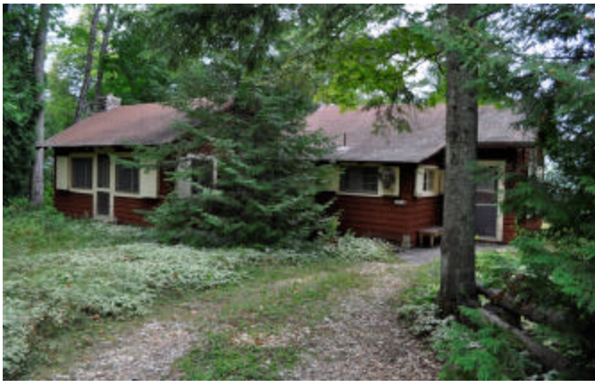
Charming, Cozy, Cedar Cabin Magnificent View of Lake Michigan Sunrise

“Same Time Next Year” on Lakeshore Road 6048 Lakeshore Rd Jacksonport, Wisconsin